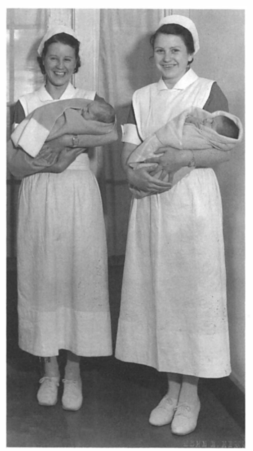
First year nursing students, 1939 work away from Banner Elk. Dorothea Dix State Mental Hospital in Raleigh was used as the clinical site for psychiatric nursing, and the Children's Free Hospital and General Hospital, both in Louisville, Kentucky, were used respectively for pediatrics and advanced medical surgical nursing. 25

While the academic component of the Grace Hospital School of Nursing met the highest standards of the North Carolina League for Nursing Education, the clinical component was hampered by the size of the hospital. Nationally, standards for nursing schools were becoming more comprehensive. What was started as a small mission hospital by the Presbyterian Church, Grace Hospital and its School of Nursing had evolved into a training ground for registered nurses (R.N.s): these students needed experience in psychiatric nursing, pediatric nursing, and advanced medical-surgical nursing. Although Grace Hospital offered excellent experience in basic medical-surgical nursing and obstetrics, it could not provide the diversity of patients required in the other areas to give students the depth of experience they needed to sit for State Boards. In the early 1940s, to broaden students' experience and comply with North Carolina League for Nursing Education standards, Grace students did part of their clinical